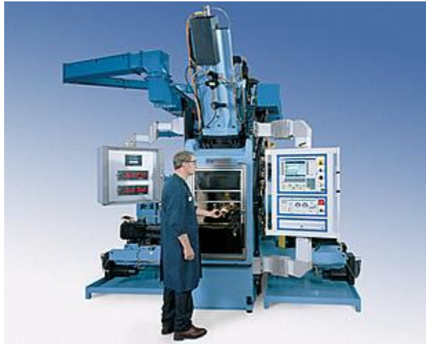
For Dana, two new Trunnion machines have proven they can significantly increase part production.