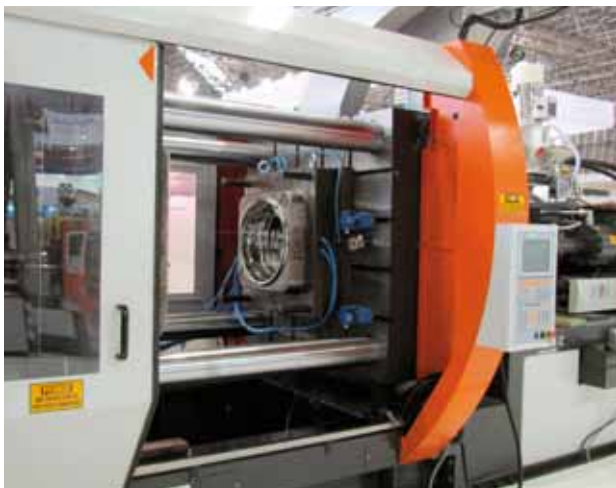
Meglio series machine from Sandretto do Brasil