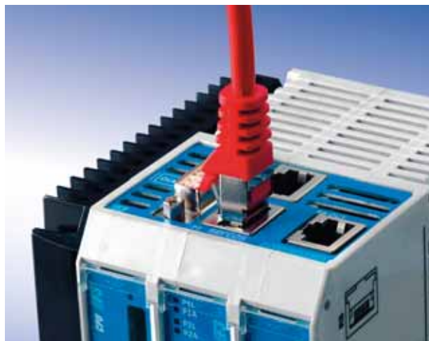
F3 basic unit with detailed view of sercos