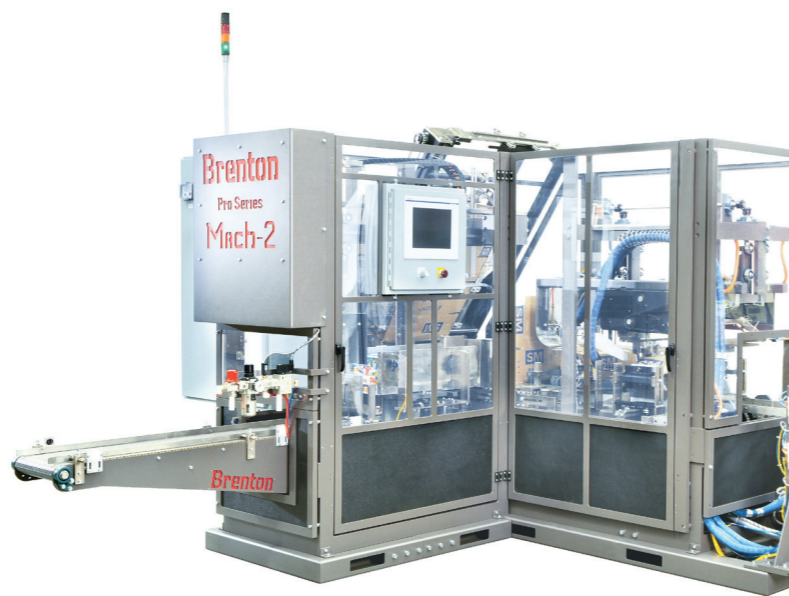
The Brenton ProSeries Mach-2 uses a Rexroth motor integrated drive and motion logic control platform to improve machine performance, save space, lower costs and save energy.