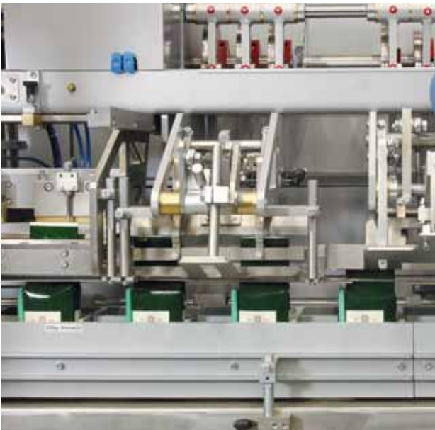
Two bags are filled and closed in parallel (picture shows the multi-stage folding and closing process)

Parameterization of the servomotors and drives is largely automatic, based upon electronic name plates. Upon the first use or change-out of a device, both motors and drives are identified by the central controller and are then configured based upon the specified parameters. Because sercos III offers Ethernet-based communication, there is also no need for hardware to set bus addresses.