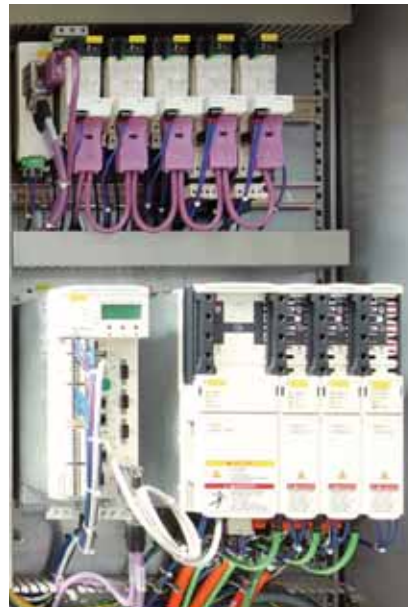
The PacDrive 3 automation solution: The new LMC-series controller is on the left, next to it on the right is the shared power supply with LXM 62 servo drives arranged upon it; above this, a row of TeSys U motor starters

Thomas Krimmel sees even greater future potential for savings in ILM servo modules. These servomotors with integrated control technology are currently being readied for market introduction by Schneider Electric. ILM servo modules use a flexible approach to networking that incorporates pre-terminated hybrid cables and distribution boxes and they further reduce the already low space requirements in the control cabinet permitted by the LXM 62 servo drives. The same power supplies can be used for both ILM servo modules and LXM 62 servo drives. This allows the two drive series to be combined in mixed configurations as well. Krimmel summarizes the prospects for this technology by pointing out that "we can use the ILM series like the PacDrive modular programming concept to further refine our design concepts for independent mechatronic machine modules. This will also significantly lower the costs of producing different versions of our equipment designs."