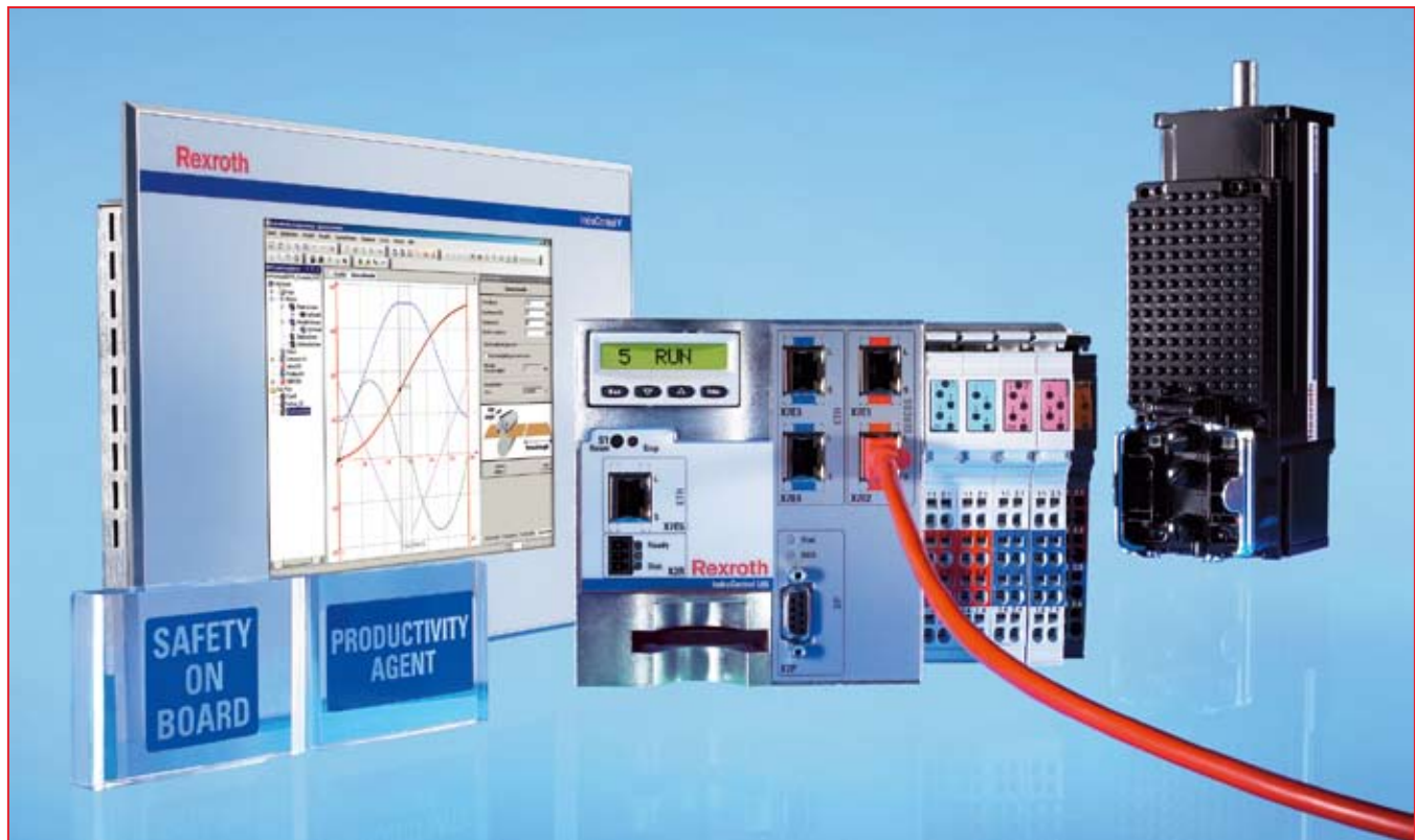
Teepack counts on IndraMotion for Packaging from Rexroth for its series PERFECTA

proven to be an easy to implement drive communication and highly productive in numerous applications in food production and packaging. The retention of the drivers and applications simplifies the upgrade to SERCOS III. "An important advantage of Rexroth and SERCOS is the high acceptance of users worldwide", points out Andreas Meyerling. With this Teepack continues to cater for con-